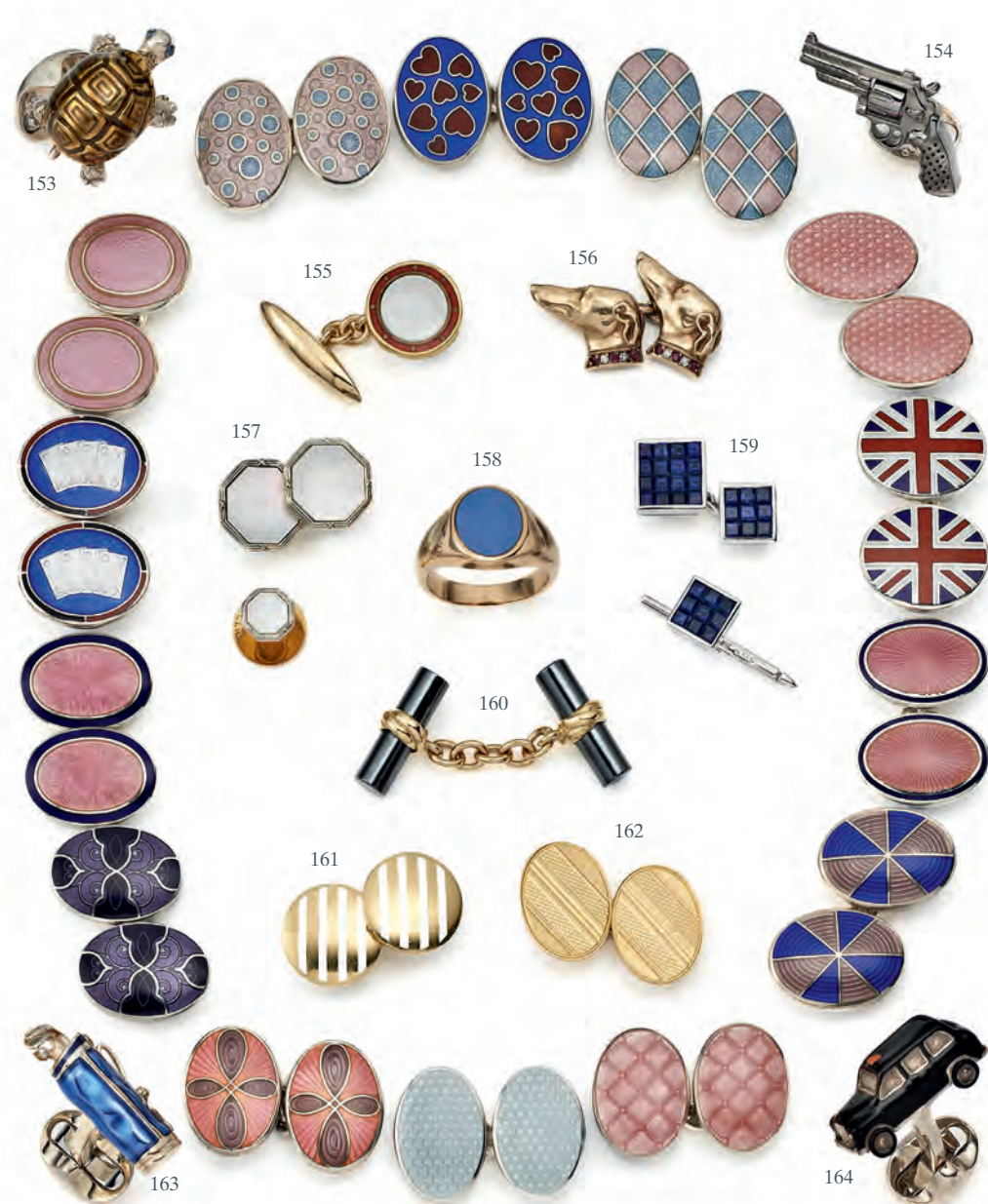
Silver and enamel ovals all