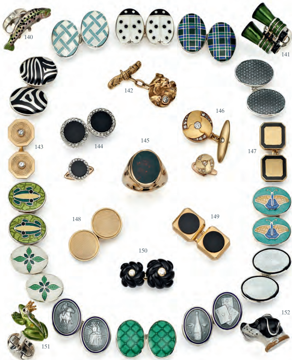
Silver and enamel ovals all